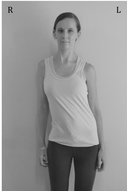
Abnormal Posture: Left Pelvis Shift